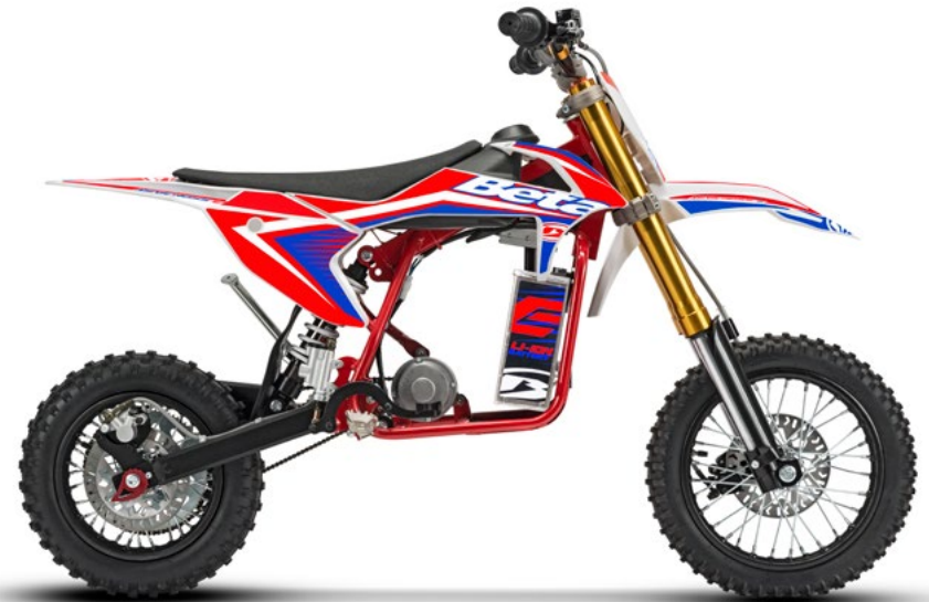
MINICROSS 6/11 anni/years/anos//ans/jahre alt