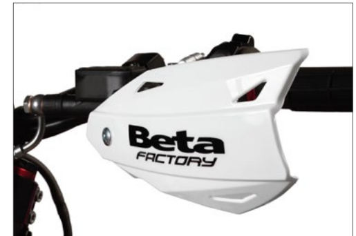
KIT PARAMANI VERTIGO HANDGUARD KIT VERTIGO KIT PROTEGE-MAINS VERTIGO KIT HANDPROTEKTOREN VERTIGO KIT PARAMANOS VERTIGO