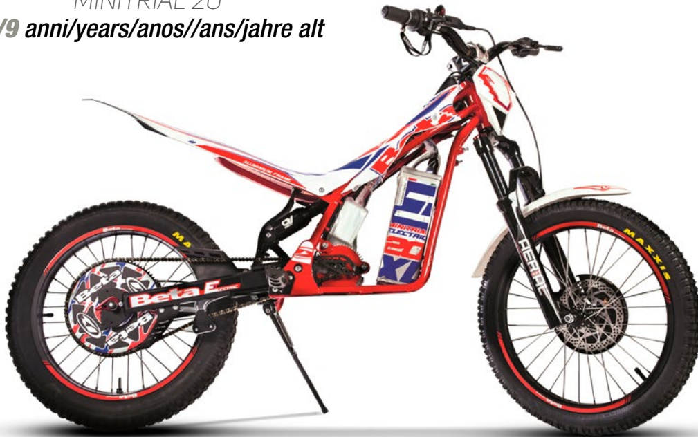
MINITRIAL 20" XL 6/9 anni/years/anos//ans/jahre alt