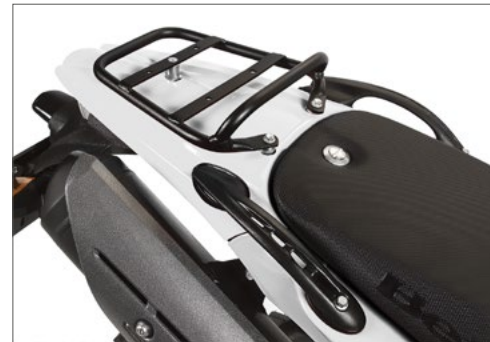
PRATICO PORTAPACCHI PRACTICAL CARRIER PRATIQUE PORTE-BAGGAGES PRAKTISCHER GEPÄCKTRÄGER PRÁCTICO PORTAPAQUETES