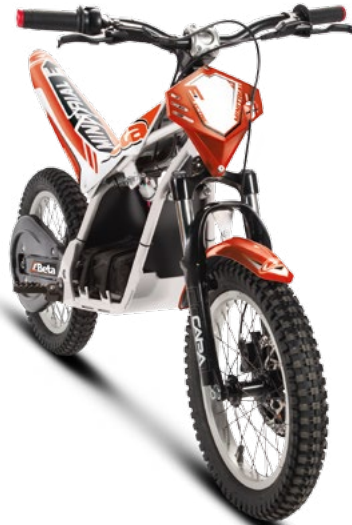
MINITRIAL 16" 4/9 anni/years/anos//ans/jahre alt